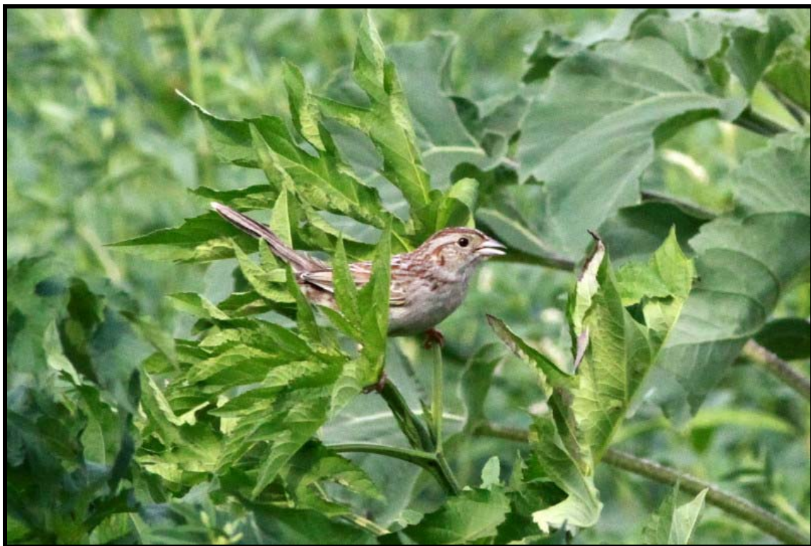
Cassin's Sparrow, May 1, 2011, Cane's Landing, Bossier City, LA.

Cassin's Sparrow is a western species, native to the arid grasslands of south-central U.S. and northern Mexico. It is a small sparrow with plain grayish-brown plumage, but has an interesting and conspicuous territorial display, called skylarking. It flies straight up into the air and floats down on fixed wings while singing. Learn more about Cassin's Sparrow at http://www.allaboutbirds.org/guide/Cassins_Sparrow/lifehistory